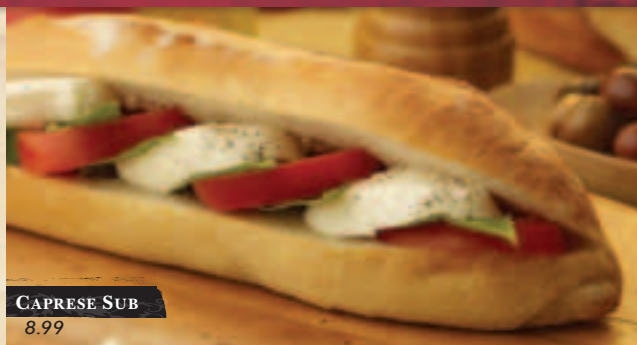
CAPRESE SUB 8.99