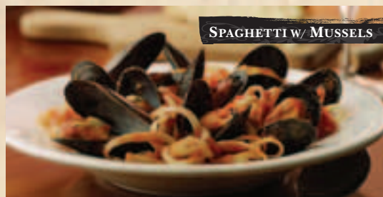
SPAGHETTI w/ MUSSELS

Shrimp, scallops & crabmeat sautéed in Alfredo sauce over fettuccini.